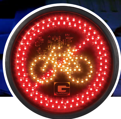
CL2 - ROUND