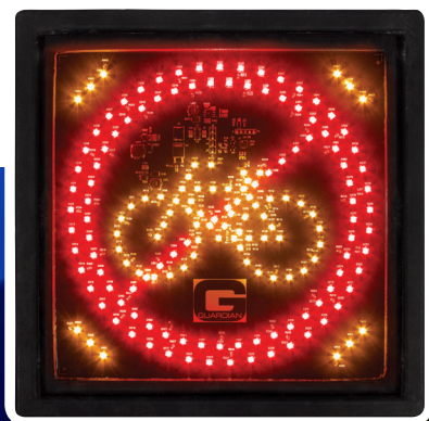
CL1 - SQUARE